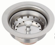
Sink Strainer Optional